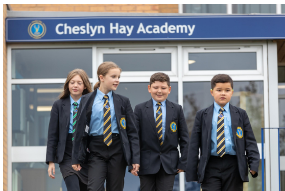
Photo proofs will be sent home with students following the school photos being taken last week.

The deadline for ordering these from Braiswick is 9:00am on Monday 17th October 2022.