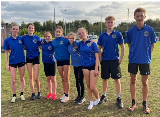
Cross Country Squad at Cardinal Griffin

Girls Football - On 28th September, our Year 10&11 team (along with a couple of Year 9's) took on Friary in their first Football game resulting in a 3-2 win. Well done!